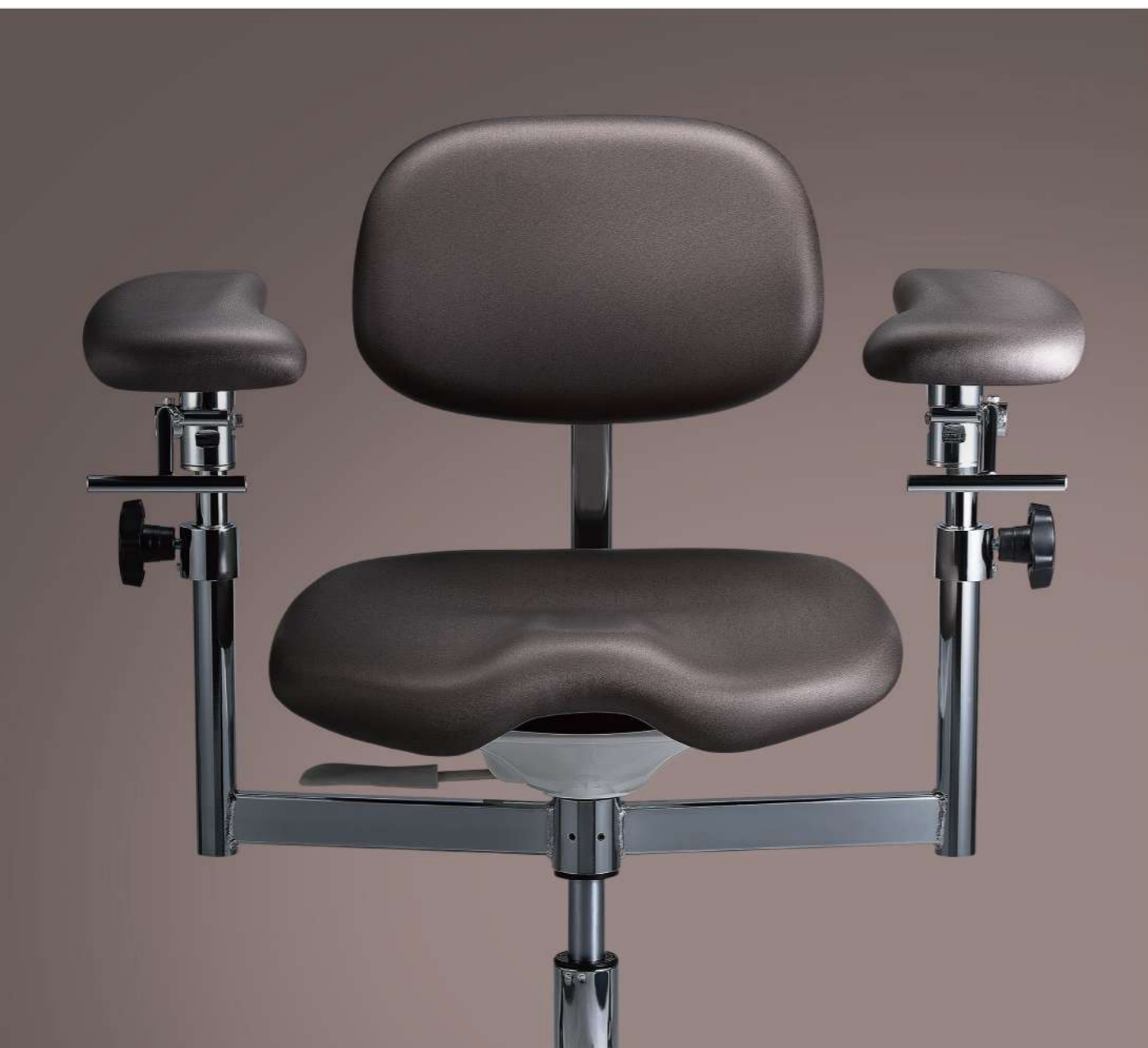
3D MS With 3D arm

- Multi-function rotating arm provides stable and comfort support of "forearm" or "elbow" during operation, especially for long operation and micro surgery.