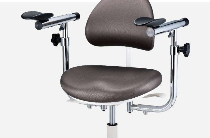
VEGA 2D With 2D rotating arm