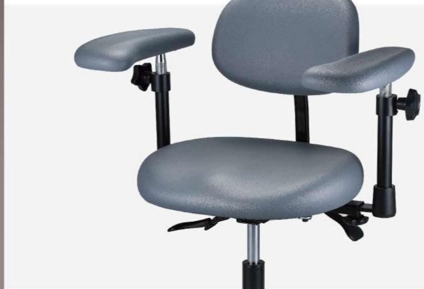
LOBA MS With rotating arm